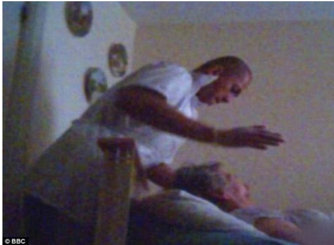
Violence against woman patient in nursing home in North London